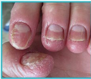
• DECK OFF