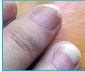
• DECK LIFT