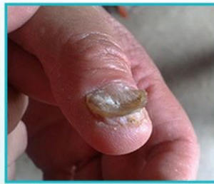
• SEPARATION OF NAIL BED