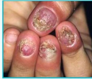
• DECK SHRINKAGE