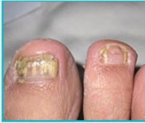
• THICKENING AND TURBIDITY