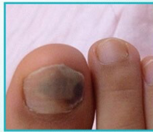
• DISCOLORATION BLACK